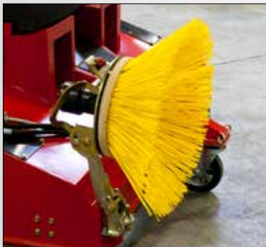
Side brush Folding Material: polypropylene Diameter: 600 mm