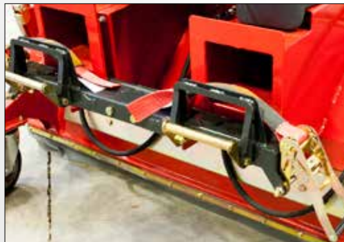
3-dimensional floating suspension Max fork section: 165 x 55 mm Min distance between the forks: 380 mm