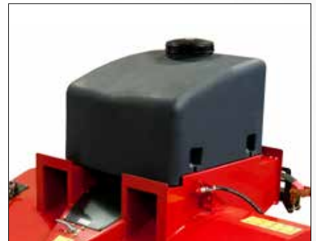
Water tank 200 l 5 waterjets